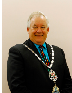
Mayor Craig Rowley

Christmas is always a busy and exciting time in the Waimate District with plenty of festivities underway in the next few weeks.