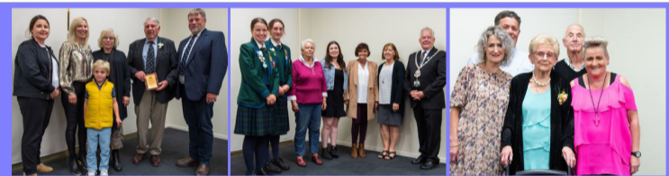
CONGRATULATIONS TO ALL 2021 CIVIC AWARD RECIPIENTS