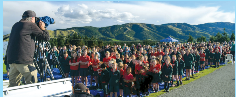
School children throughout the district belt out their own rendition of the Waimate Song, filmed by television programme Seven Sharp.