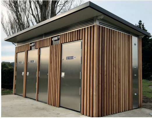
Please note this image is a visual representation only.