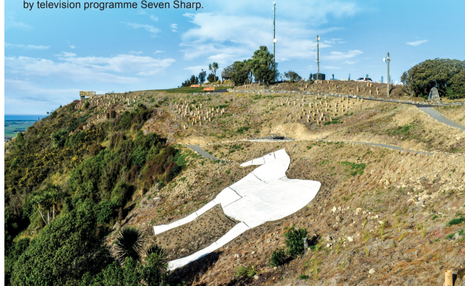
An aerial photograph of the White Horse redevelopment.