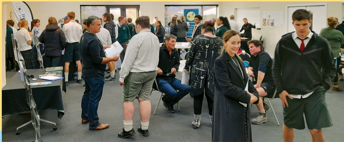
Over 75 visitors at the Employment Fair held at the Waimate Event Centre on 24 May.