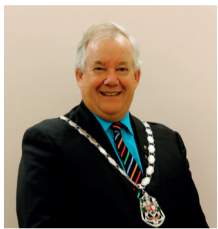
Mayor Craig Rowley

Less than nine weeks until the general election and the Central Government seems to be in a rush to get their water reforms passed through Parliament. The Water Services Entities Amendment Bill was open for public consultation for just under two weeks. The bill is a significant piece of legislation which will fundamentally alter Council's roles and responsibilities. Democracy cannot be rushed; however, with their water reforms, the Government seems overeager to sidestep the level of scrutiny that is required for a legislation of this scale.