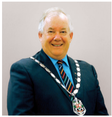
Mayor Craig Rowley

Welcome everyone to the first edition of Newsline for 2025!